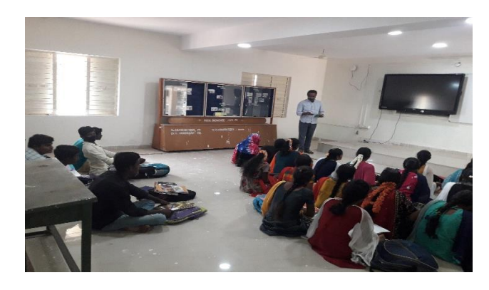
I B.Sc Azeotropic Mixtures