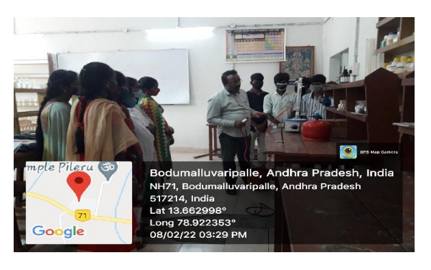
II B'Sc Heating of compound with water condenser