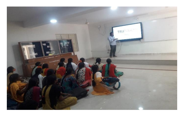
II B.Sc Environmental Audit-2