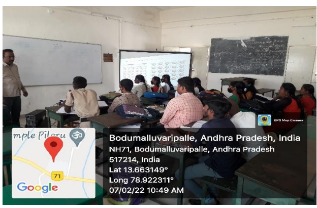
IB.Sc Solid state - 1