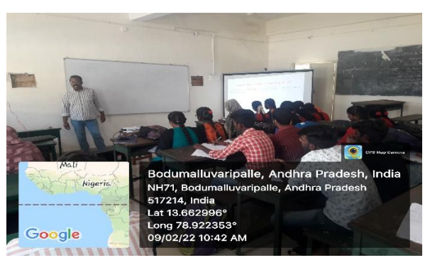
I B.Sc Solid state - 2