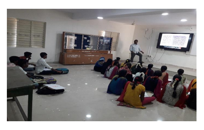
I B.Sc Liquid crystals – LCD applications