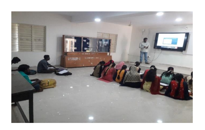
I B.Sc Determination of crystal structure