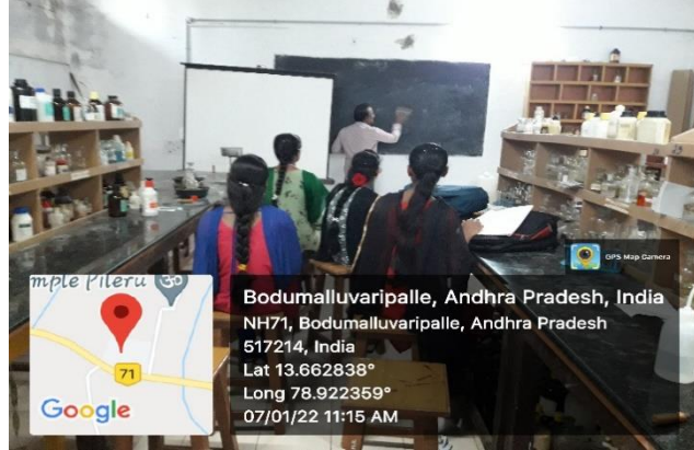
III B.Sc Structure of Glucose