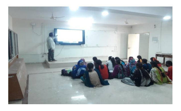
I B.Sc Elements of crystal