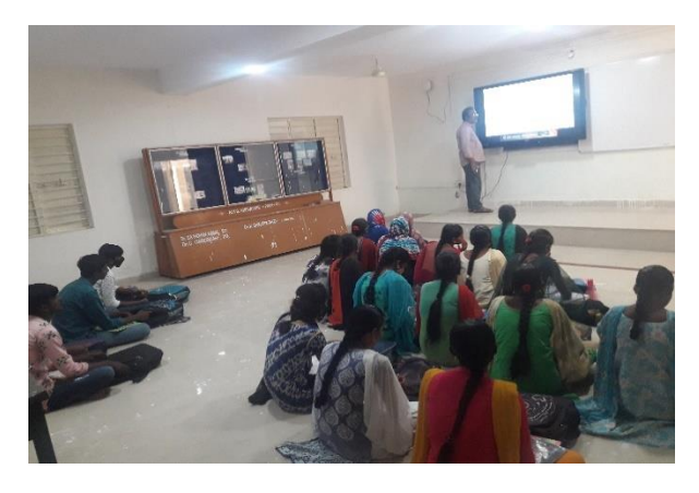
I B.Sc Defects in Crystals – 1