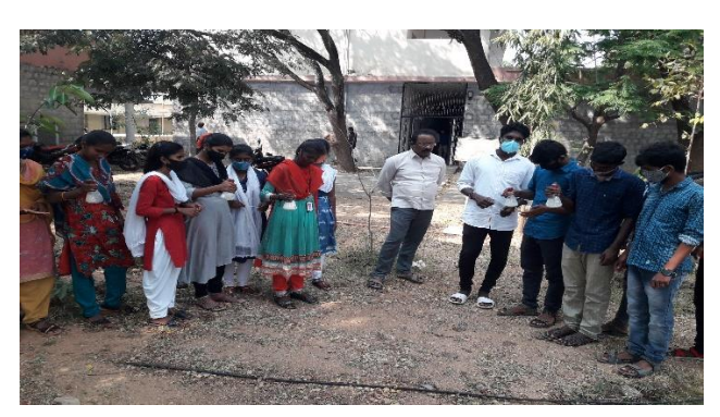
II B.Sc Green method : Synthesis of benzophenone