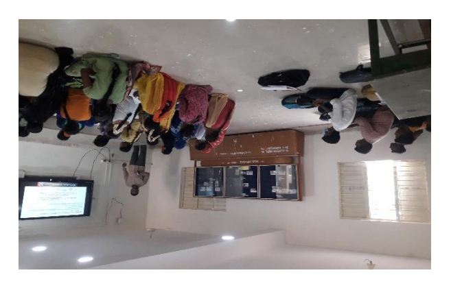
I B.Sc Colligative Properties