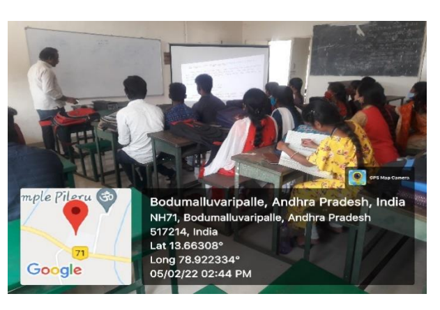
II B.Sc Environmental Audit-1