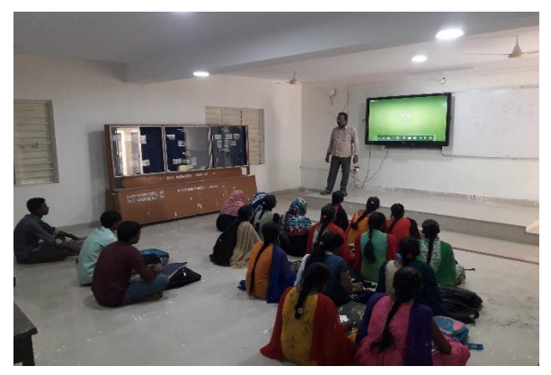
I B.Sc Gaseous State