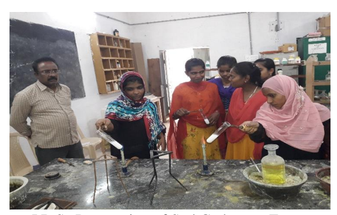
I B.Sc Preparation of Sod.Carbonate Extract