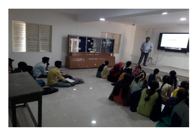
I B.Sc Steam Distillation