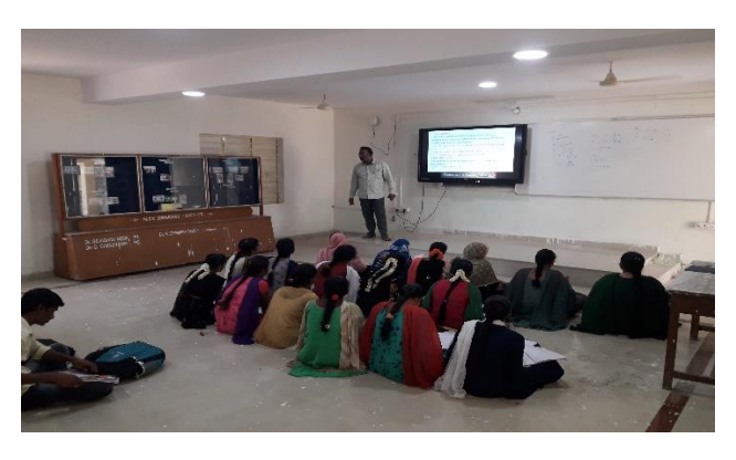
I B.Sc Osmotic Pressure - Determination