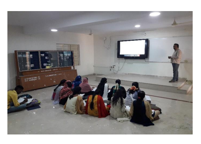
I B.Sc Defects in Crystals - 2